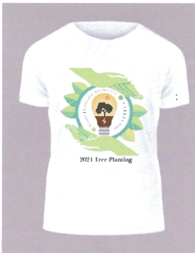
Size of Logo design 8.5 x 8.5 cm

Relative to NEA Memorandum No. 2024-28 dated June 20, 2024, inviting all Electric Cooperatives (ECs) to support and participate in the Nationwide NEA-EC Simultaneous Line Clearing and Tree Planting Activity on August 23, 2024, and consistent with the thrust of the government to promote unity, below are the official designs for the tarpaulin and t-shirts for the event: